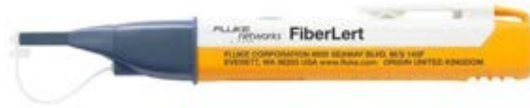
Figure 4. Fiber optic cable tester