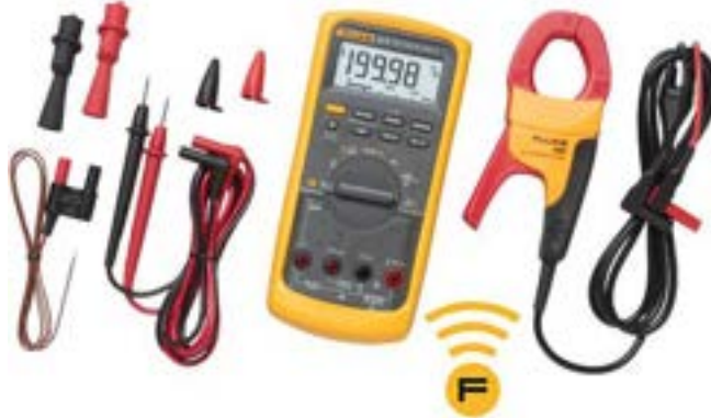
Figure 2. True-RMS Digital Multimeter Combo Kit