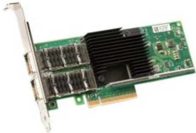
Figure 3a. Network Interface Card (NIC) for Dell T640