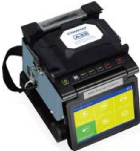
Figure 1. Fusion Splicer