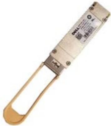
Figure 3b. Networking Transceiver for Dell T640