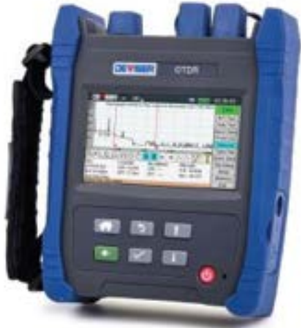
Figure 2. Optical Time Domain Reflectometer (OTDR)