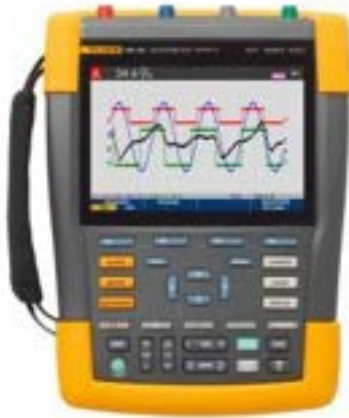
Figure 3. Portable Oscilloscope/Scopemeter