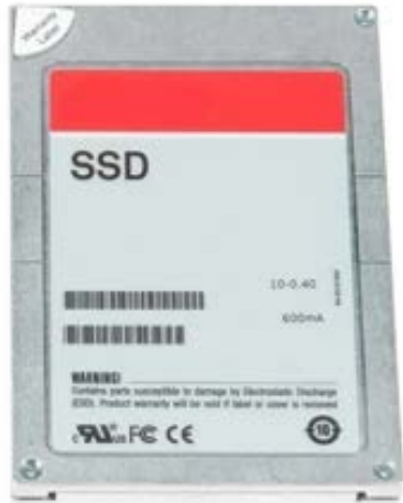
Figure 4. Solid State Drive

In compliance with Republic Act No. 9184, Section 18, and the 2016 Revised Implementing Rules and Regulations, Section 18, brand names are used because of compatibility with existing platforms or equipment which will maintain performance, functionality and useful life.