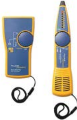
Figure 1. Network Cable Tester (Toner and Probe)